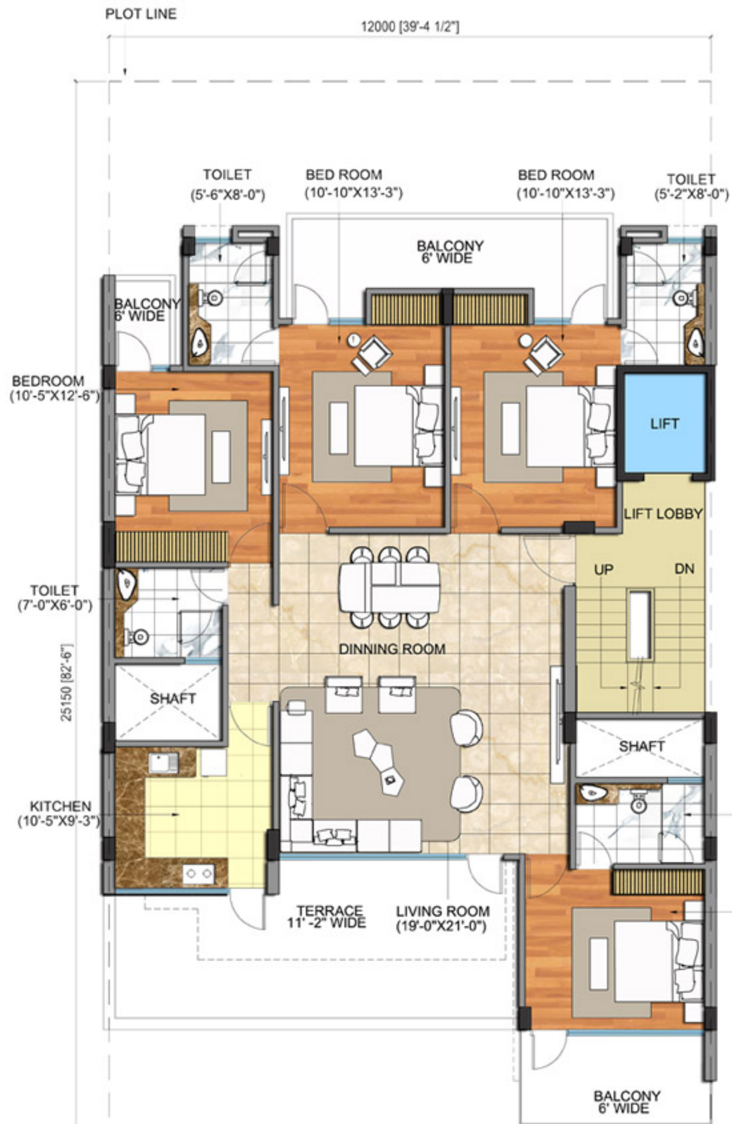
UPPER GROUND FLOOR PLAN (360 SQ. YARDS)